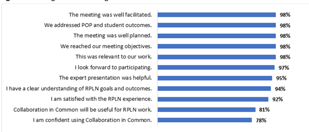
Figure 5. Average RPLN meeting feedback

Another participant seconded the value of having a sharper focus and noted that the network provided opportunities to focus not only on short-term problems but also on the long term—what is good math instruction, how to develop the kinds of practices and protocols that benefit all students, especially low-income students. According to her, one of the major difficulties with math instruction is to develop a common set of goals and professional norms. "Everyone sees math instruction through a different lens." She also believed that the network was very helpful in developing participant depth-of-knowledge levels, starting with procedures and progressing to subsequent levels of understanding the problem, thereby allowing districts and individual network members to create their own learning experiences. Figure 5 shows the average RPLN meeting feedback from participants.