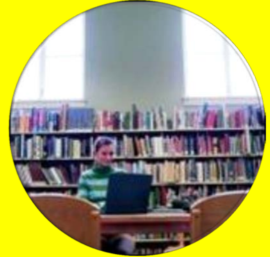
Virtual Learning Environment