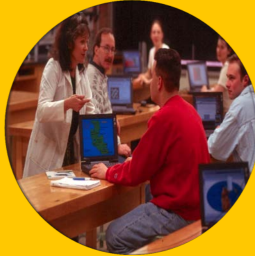
Blended Learning Environment